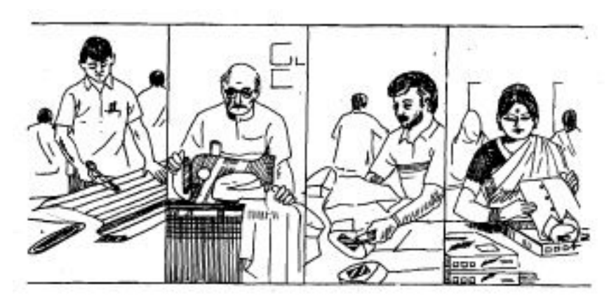
Figure 20.2 Division of Labour in Manufacture

Division of labour in industry or manufacture: This is a process, which is prevalent in industrial societies where capitalism and the factory system exist. In this process, manufacture of a commodity is broken into a number of processes. Each worker is limited to performing or engaging in a small process like work in an assembly line (see Figure 20.2: Division of Labour in Manufacture). This is usually boring, monotonous and repetitive work. The purpose of this division of labour is simple; it is to increase productivity. The greater the productivity the greater the surplus value generated. It is generation of surplus value that motivates capitalists to organise manufacture in a manner that maximises output and minimises costs. It is division of labour, which makes mass production of goods possible in modern, industrial societies. Unlike social division of labour where independent producers create products and exchange them with other independent producers, division of labour in manufacture completely divorces the worker from his product. Let us examine this point in more detail by trying to understand the implications of division of labour in manufacture.